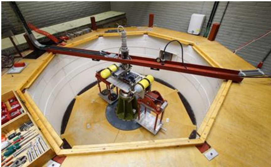
Geotechnical centrifuge that underwent a total rebuild in 2009/10 (diameter ca. 1.8 meter).