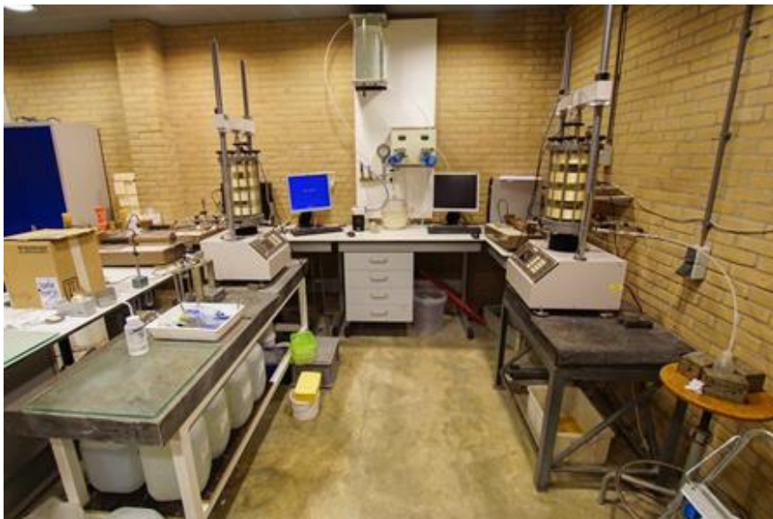
Climate room with triaxial cells. In these rooms, long term temperature controlled experiments are performed.