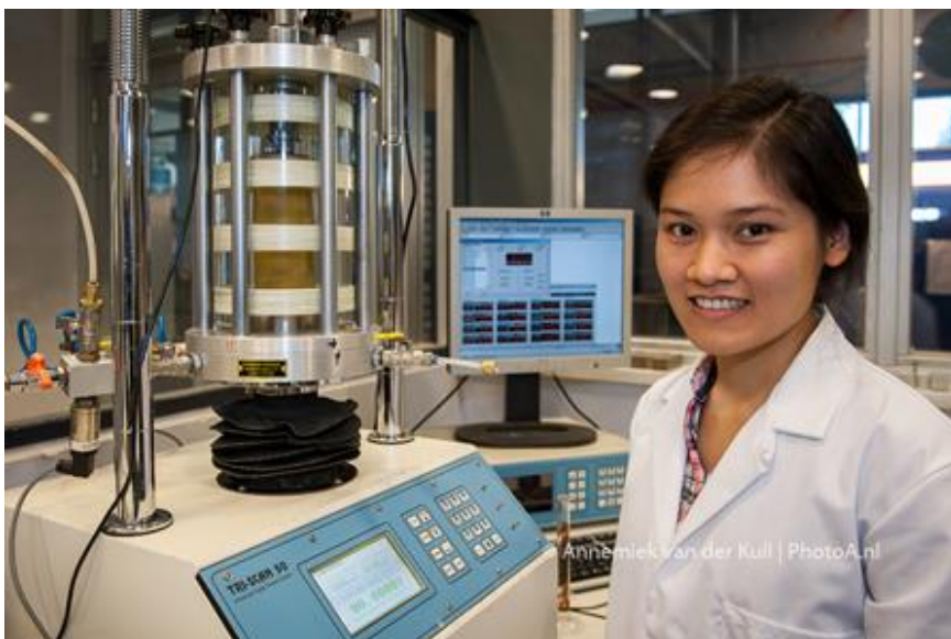
Tri-axial soil experiments in the large climate chamber, where temperature and humidity controlled experiments are performed.