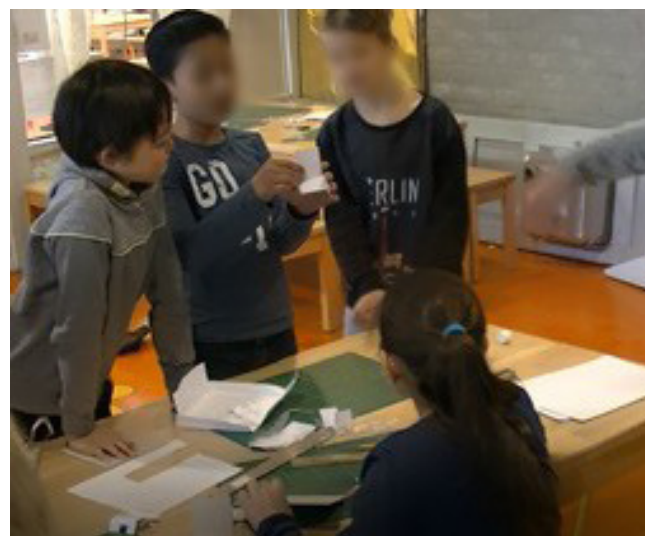
Figure 3: First session. Working with paper

on paper" phase. A few pupils did not get past the "draw a chair on paper" phase. At the end of the first session it was intended to share all chair models and evaluate the process of transforming the 2D model into 3D parts, but the teacher and the researcher forgot to do this in all three groups.