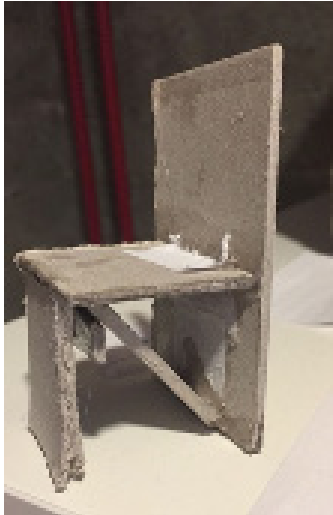
Figure 4: Third session. Working with card board

During the third session all pupils were working hard on cutting and assembling. A significant number of pupils could already colour and finish the chair (Fig. 1). During solving construction problems some children got brilliant and simple ideas about a new model or about fixing stability problems (Fig. 4).